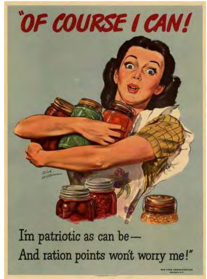
Other aspects of "Digging for victory"