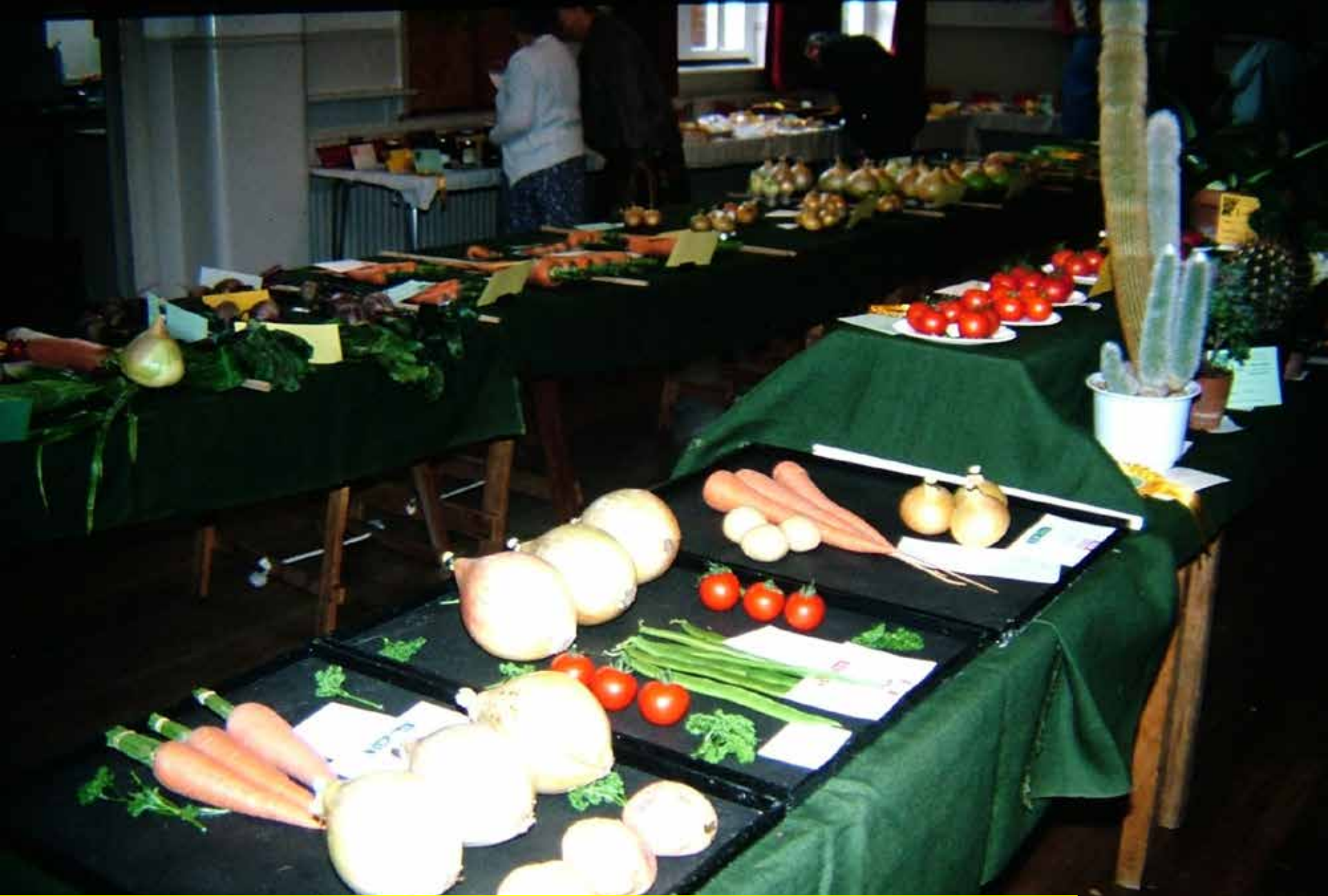
Annual Show 1994 – 50 th Anniversary