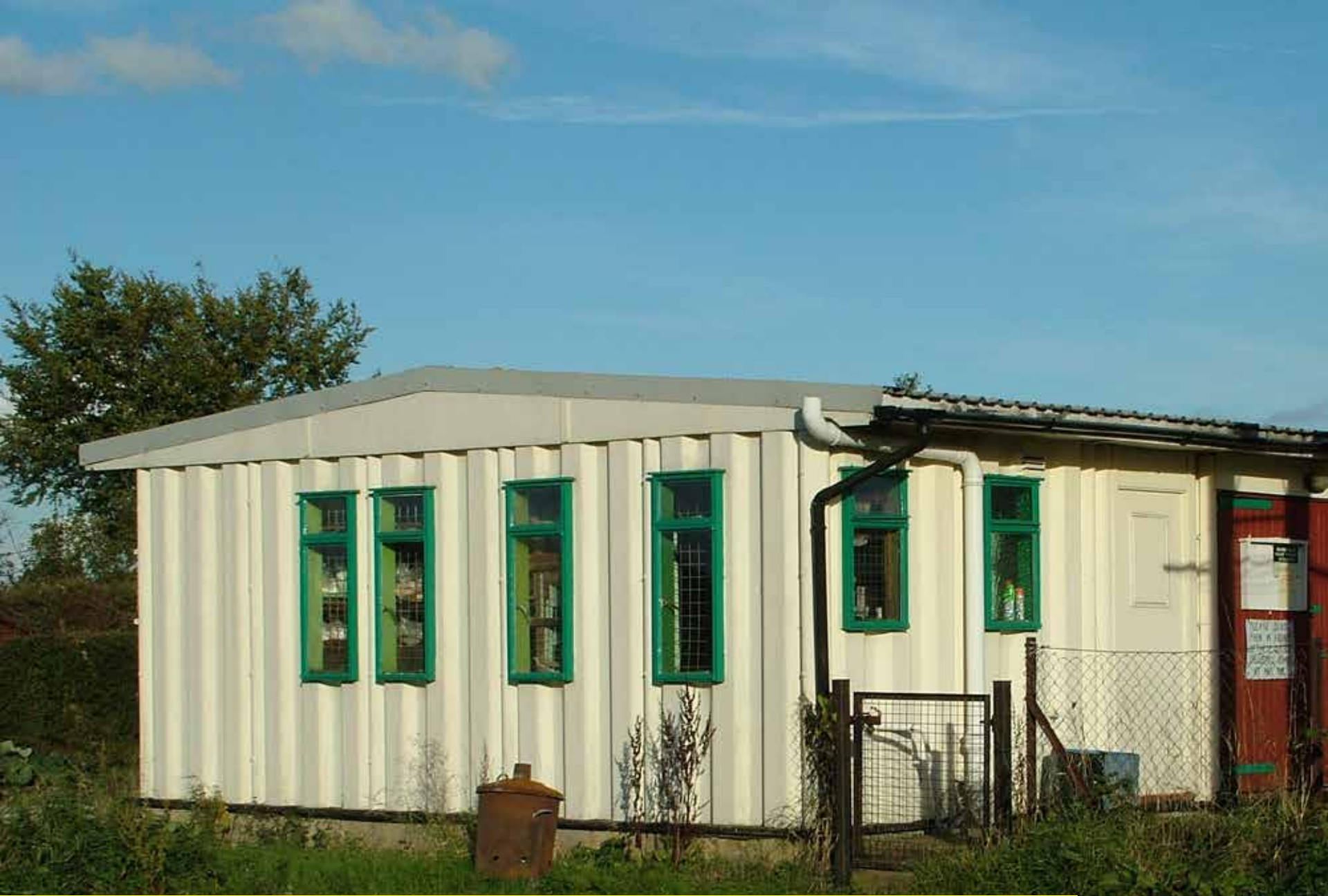
The Trading Store today