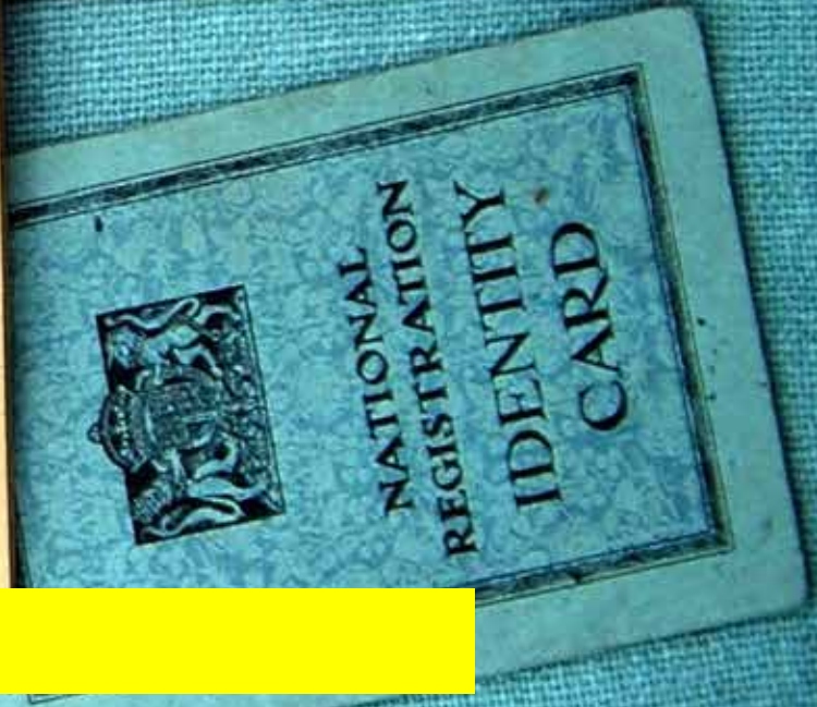
A nation at war