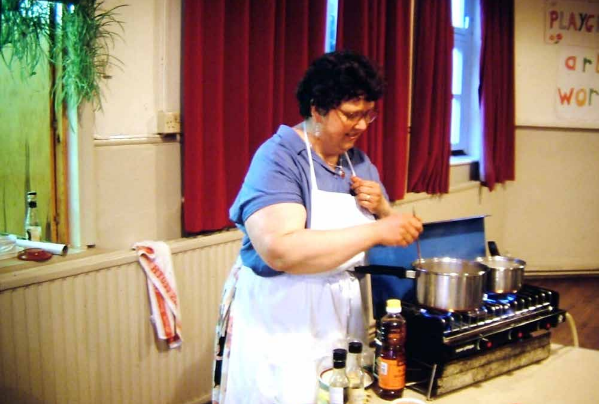
Cookery demonstration, 1994