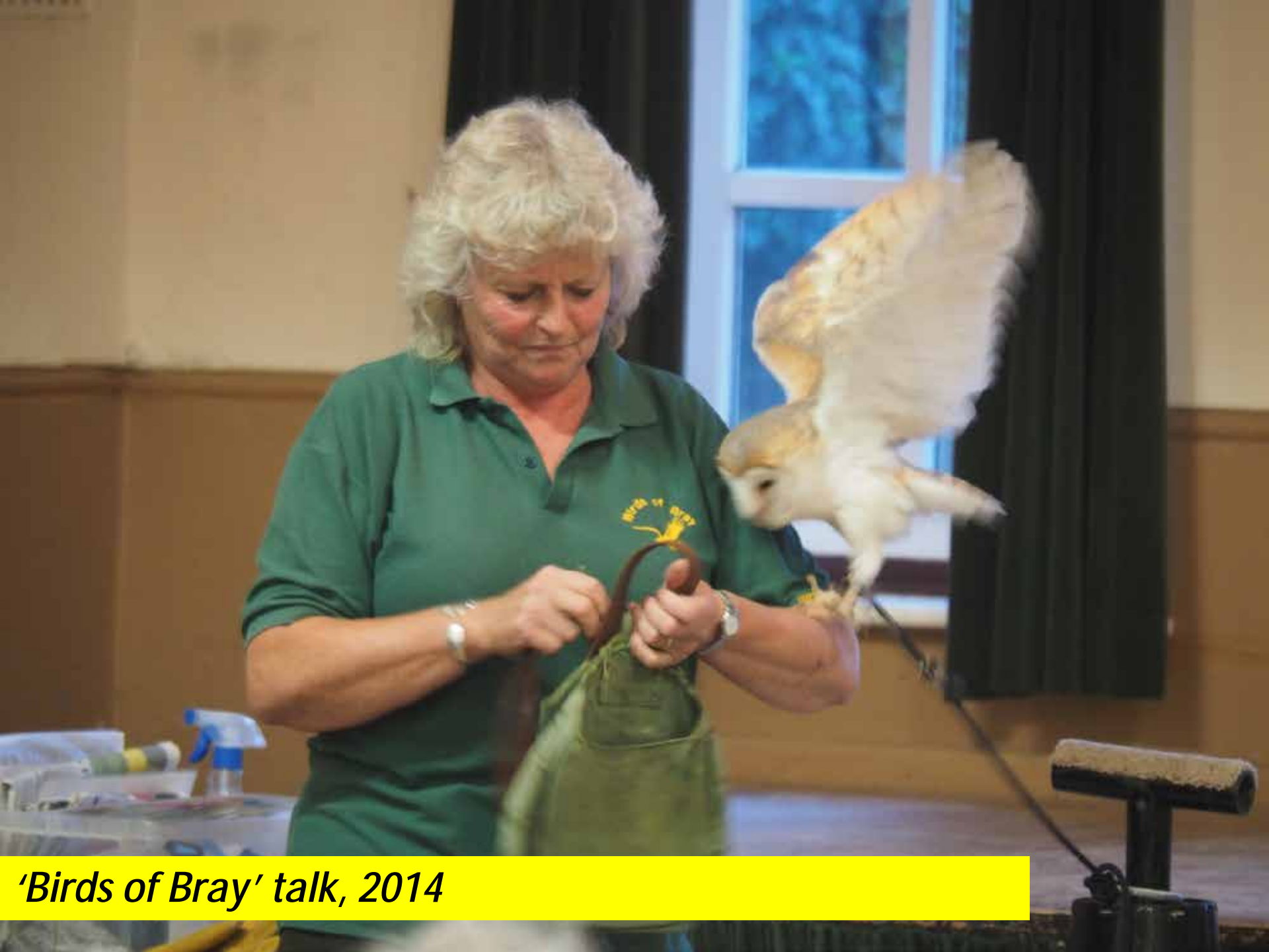
'Birds of Bray' talk, 2014