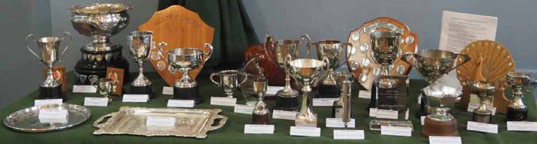
70 years of cups and trophies