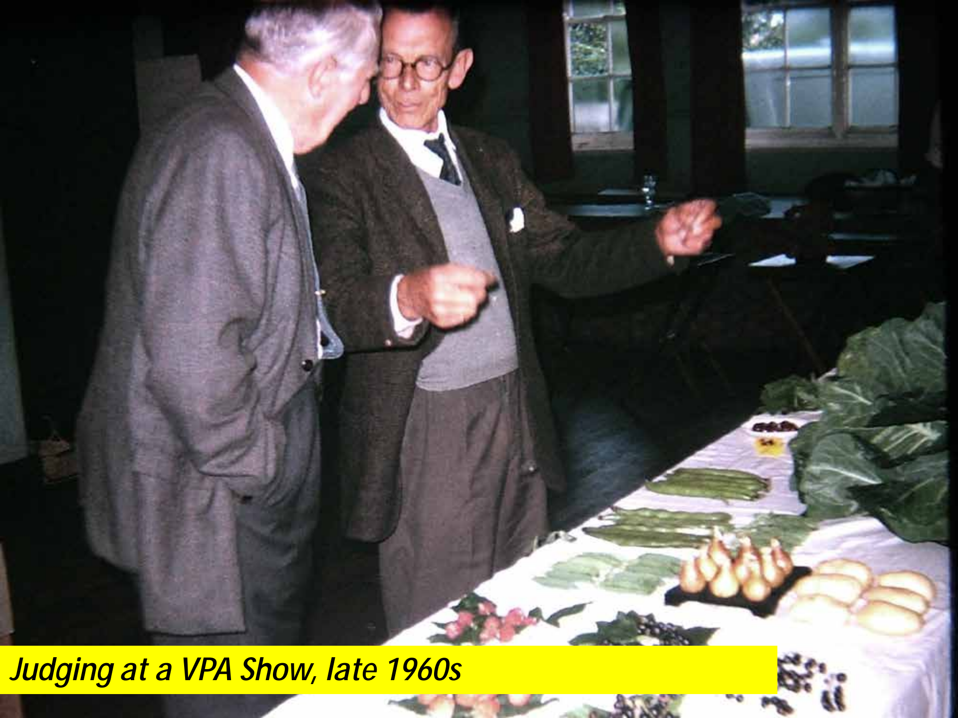
Judging at a VPA Show, late 1960s