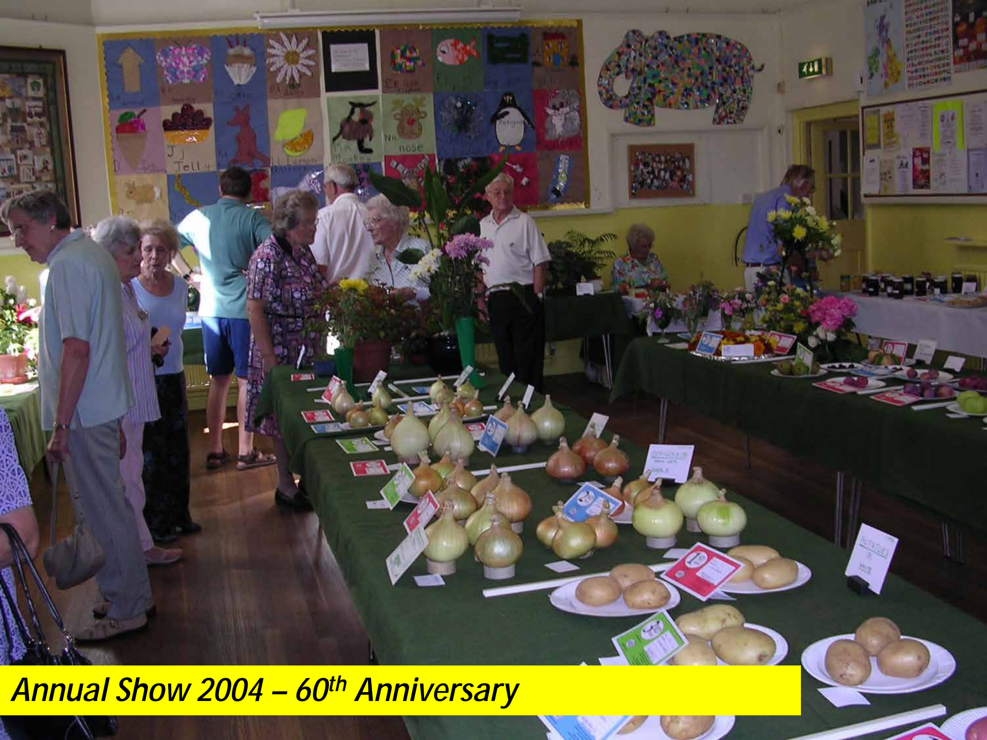
Annual Show 2004 – 60 th Anniversary