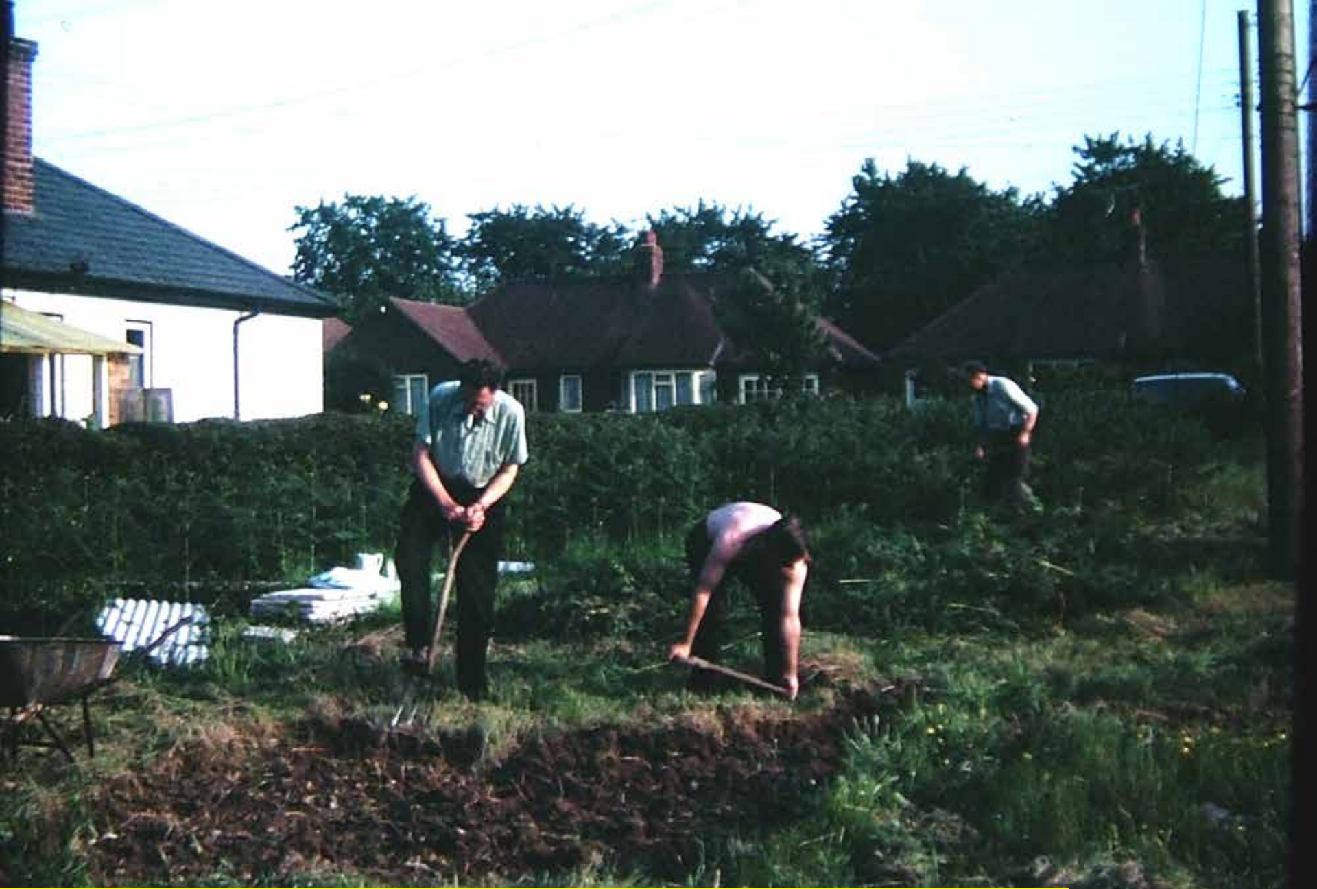
Footings for the new Trading Store, 1966