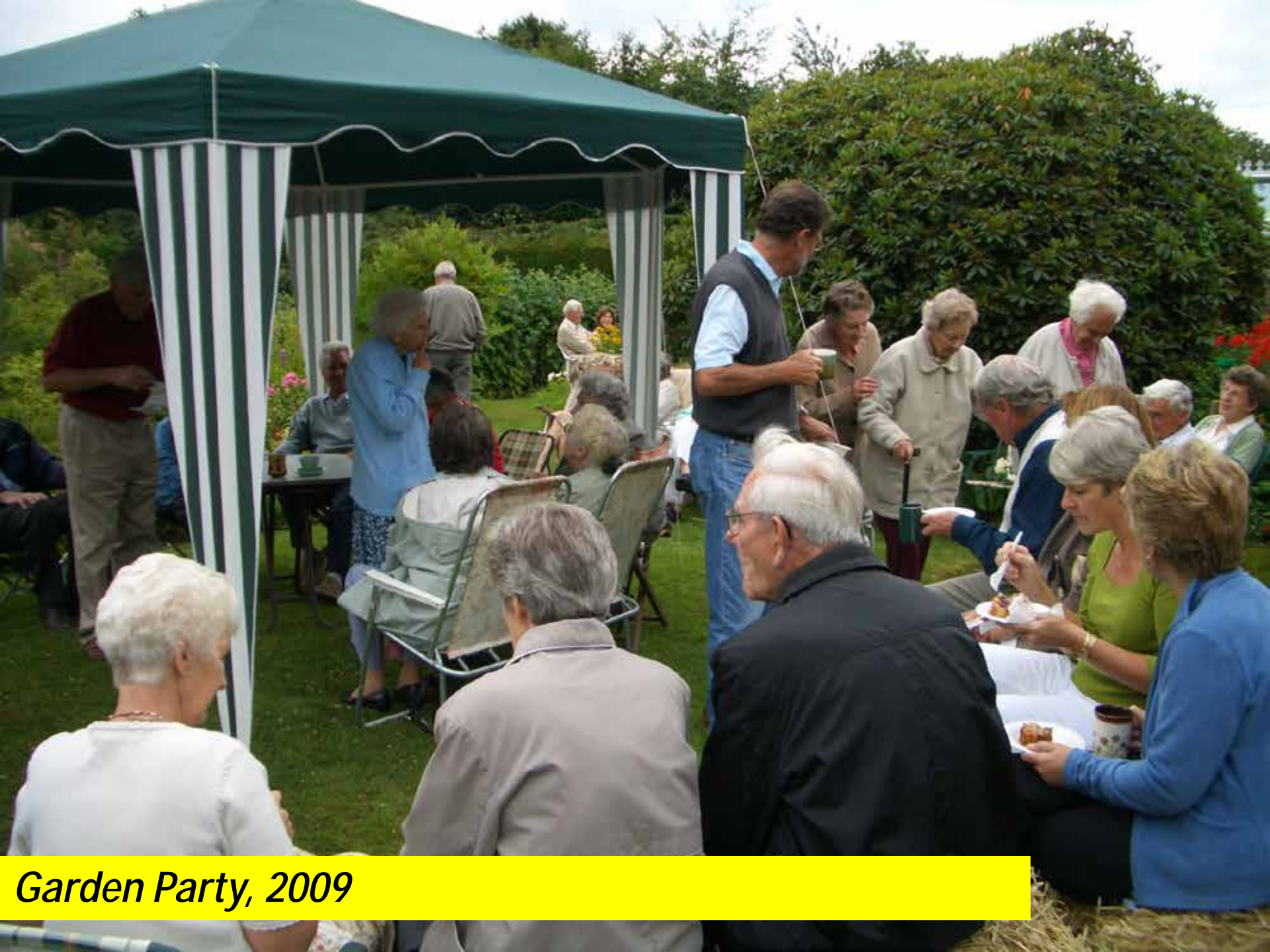
Garden Party, 2009