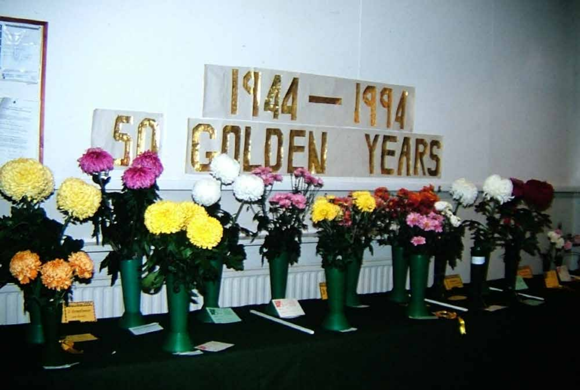
Annual Show 1994 – 50 th Anniversary