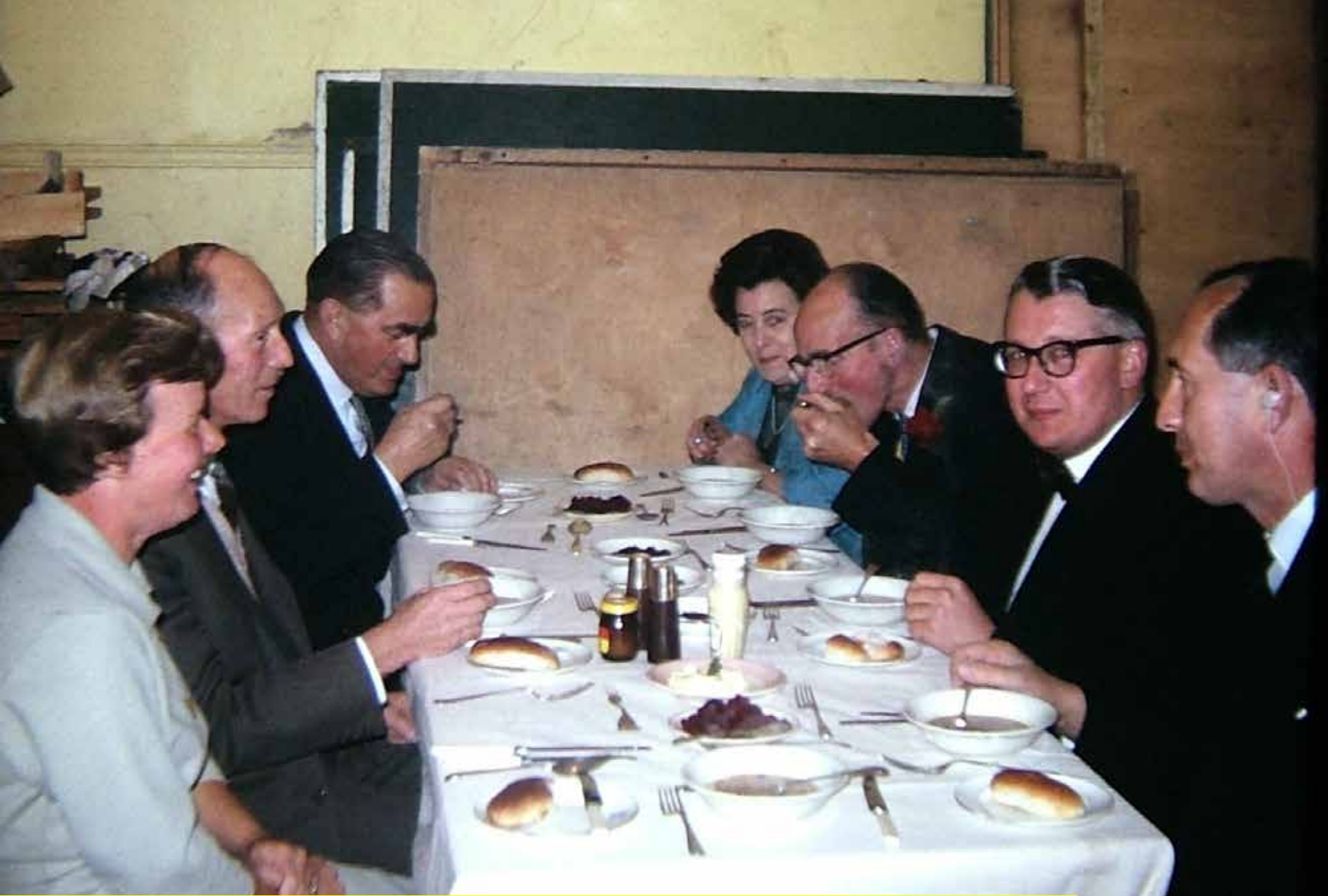
Harvest Home Supper, 1965 – the waiters' supper