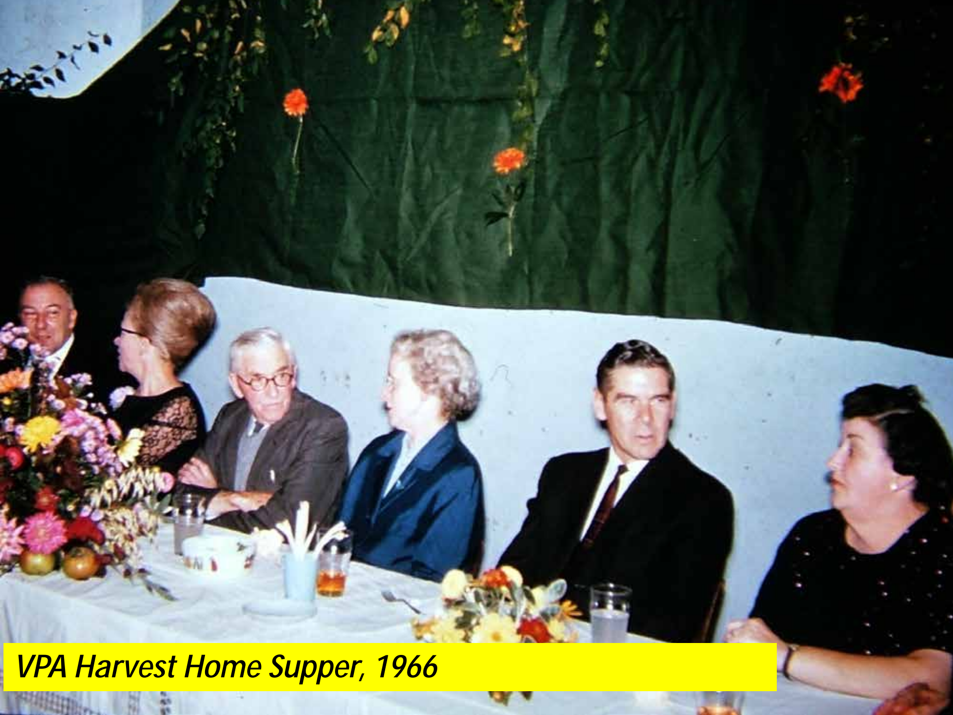
VPA Harvest Home Supper, 1966