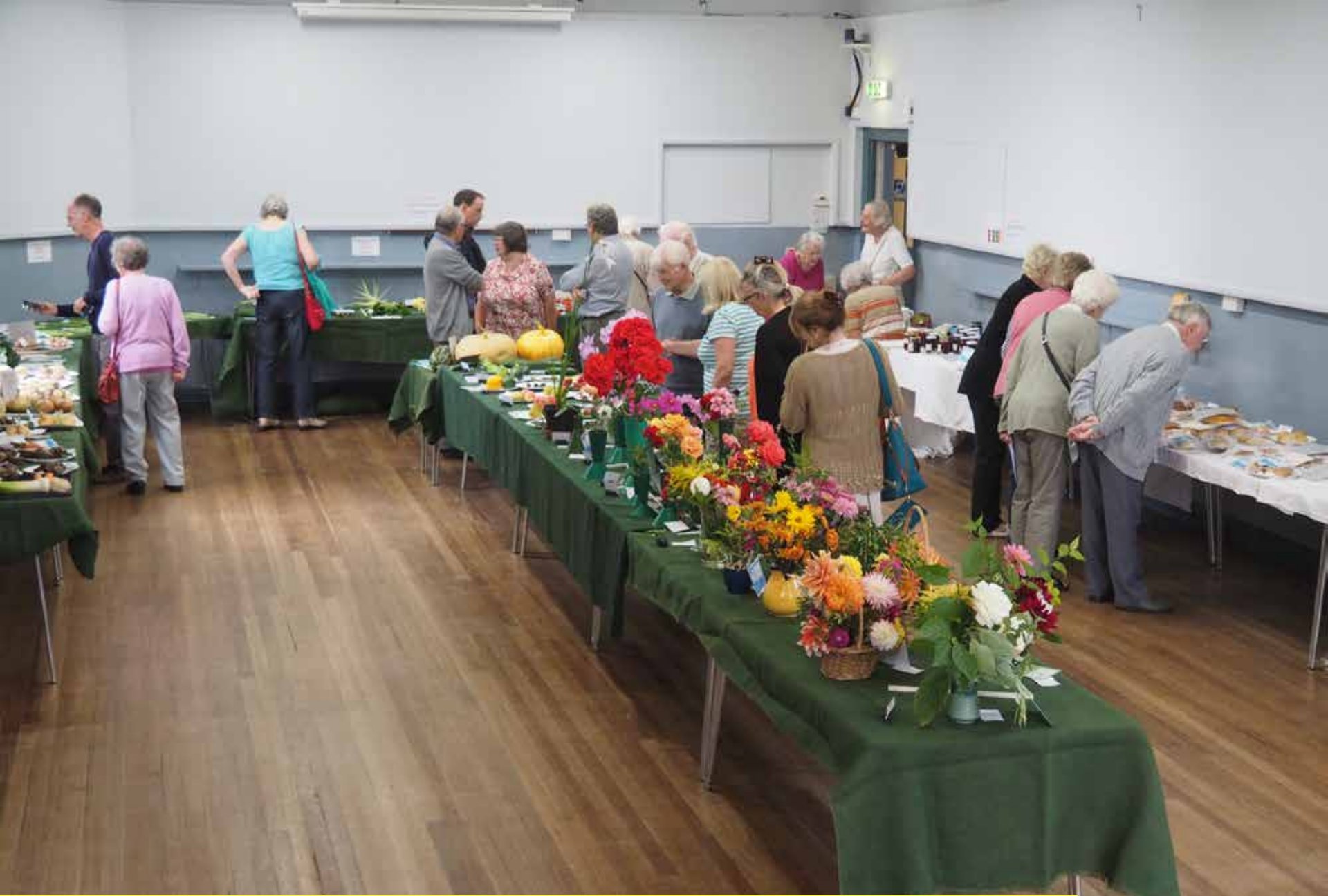
Annual Show 2014 – 70 th Anniversary