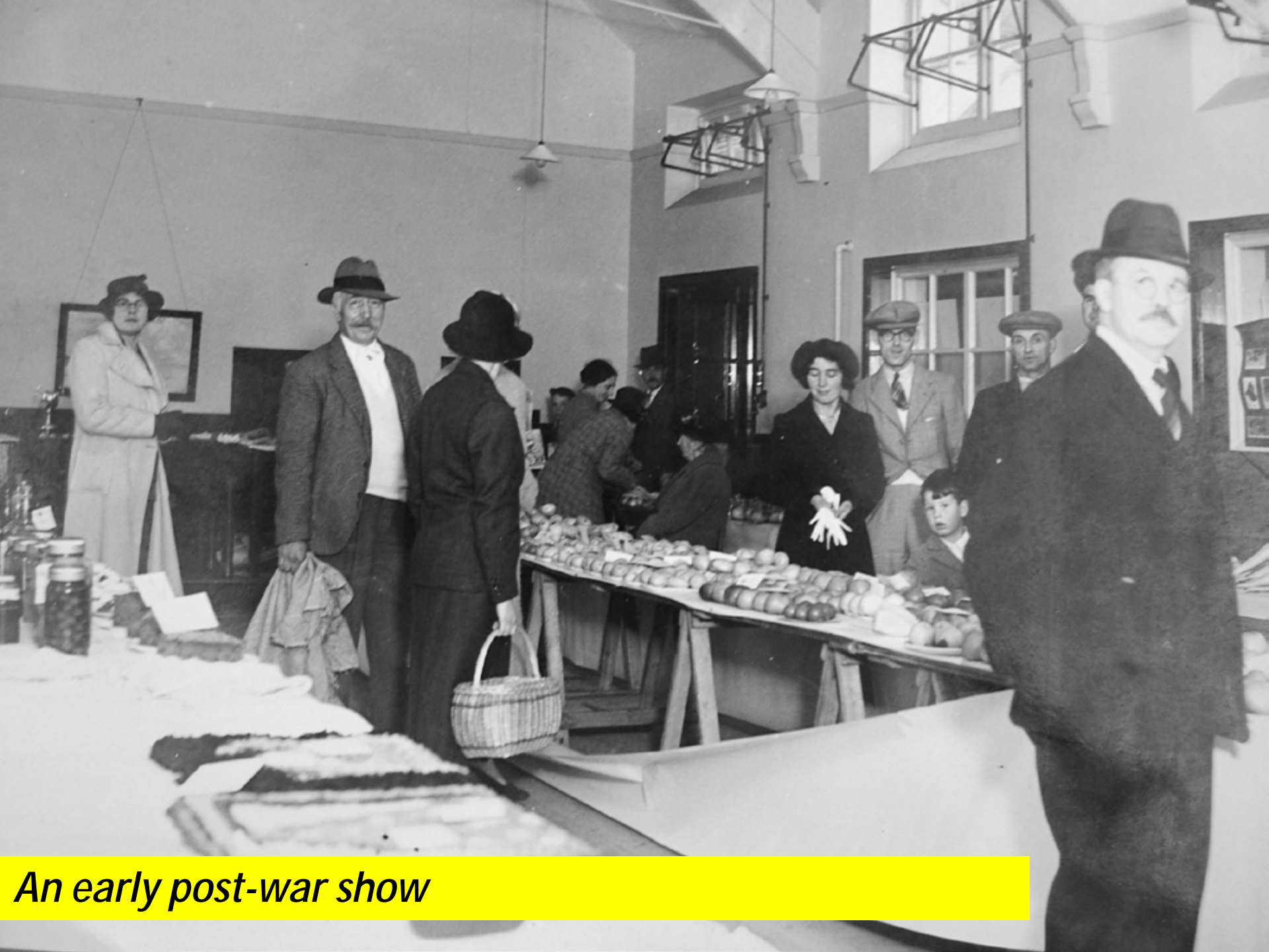
An early post-war show